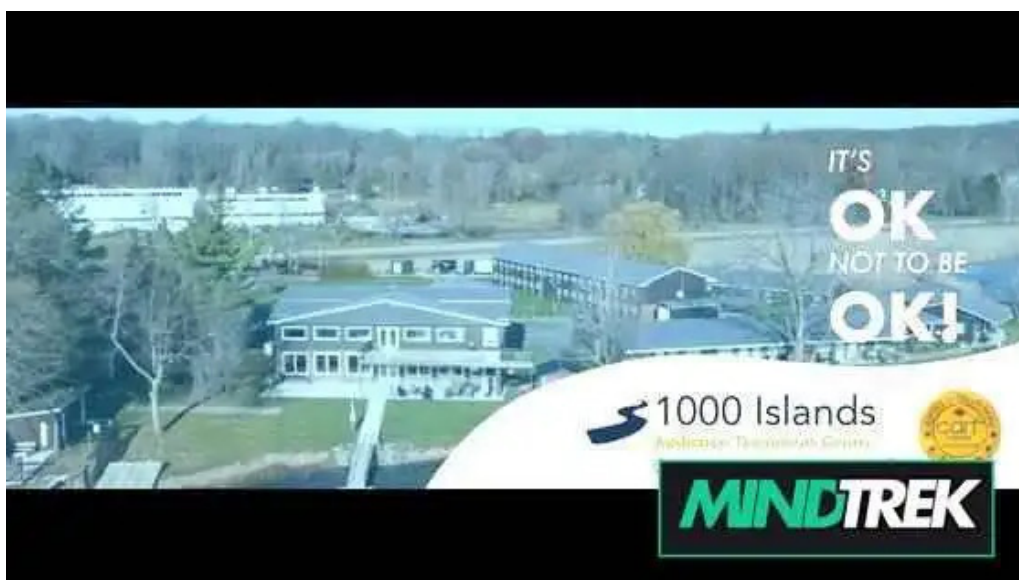
1000 islands addiction rehab treatment centre mallorytown