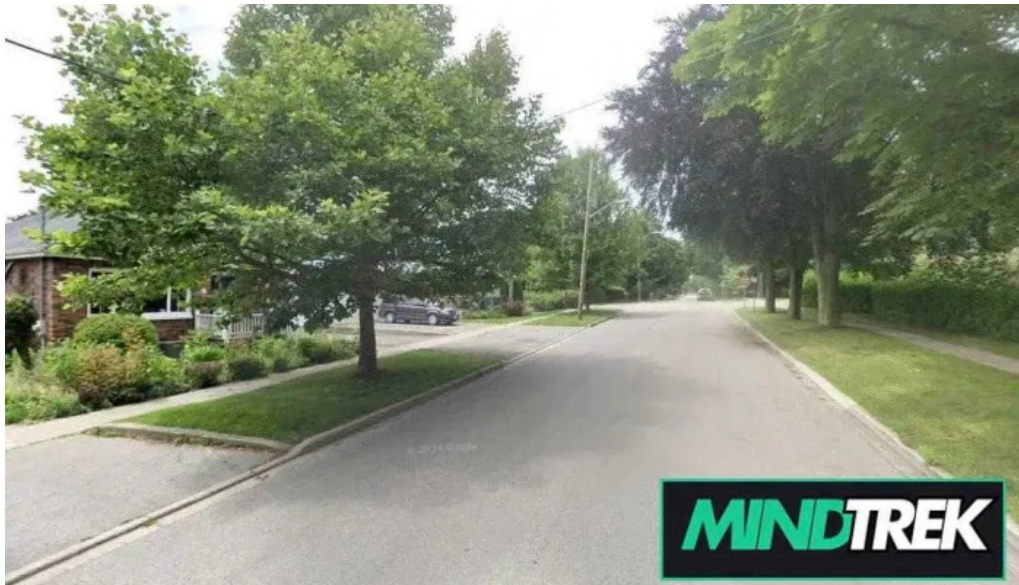
Dalton associates cobourg