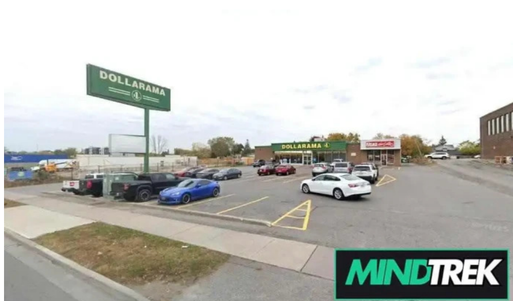
Belleville psychic belleville