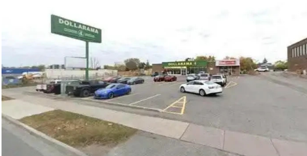
Belleville psychic all