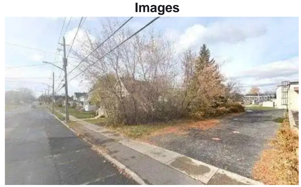
D a macleod company Itd street view 360deg

In case you want to alter any element that you consider is not correct regarding this portal, we kindly request send us a message so that we will correct it quickly. In advance thanks.