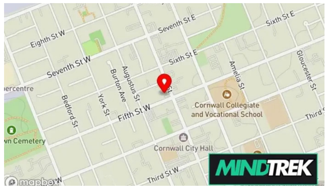
D a macleod company Itd map