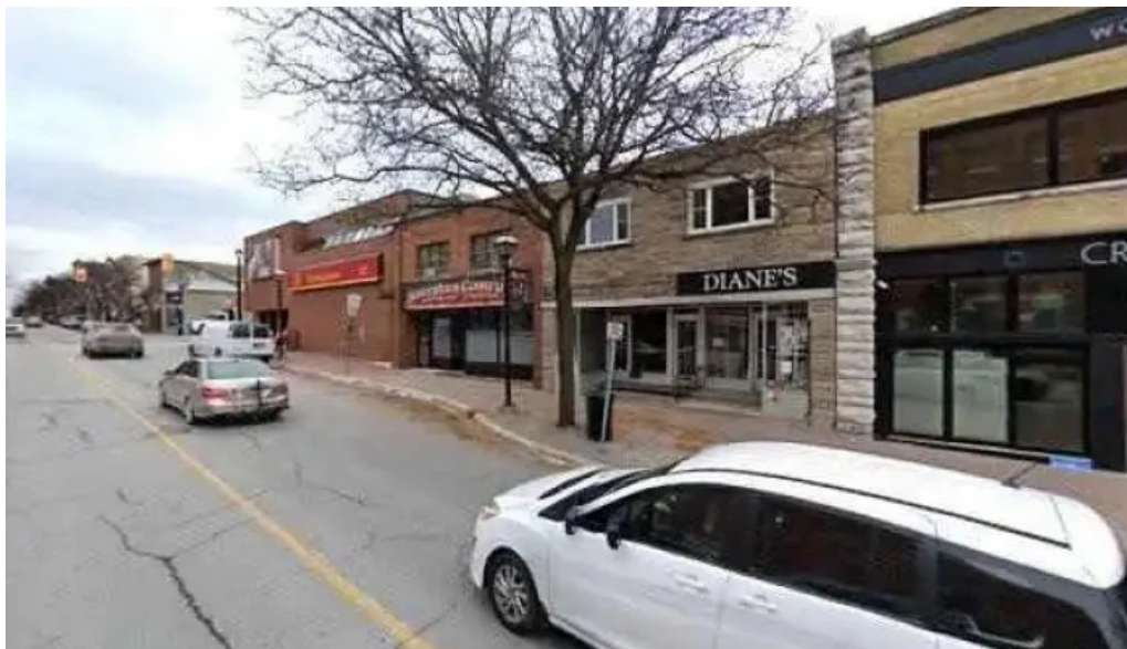
Mnp debt licensed insolvency trustees bankruptcy consumer proposals street view 360deg