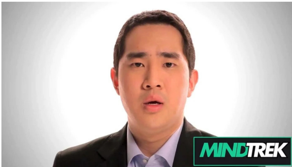
Mnp debt licensed insolvency trustees bankruptcy consumer proposals by owner