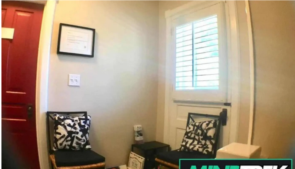
Axon music therapy cambridge