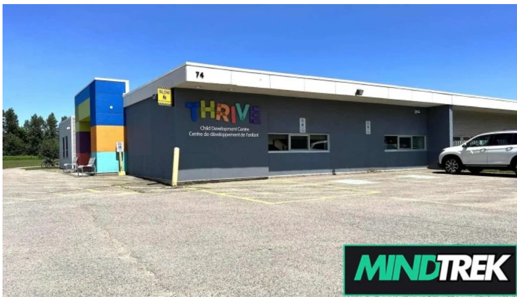
Thrive child development centre sault ste marie