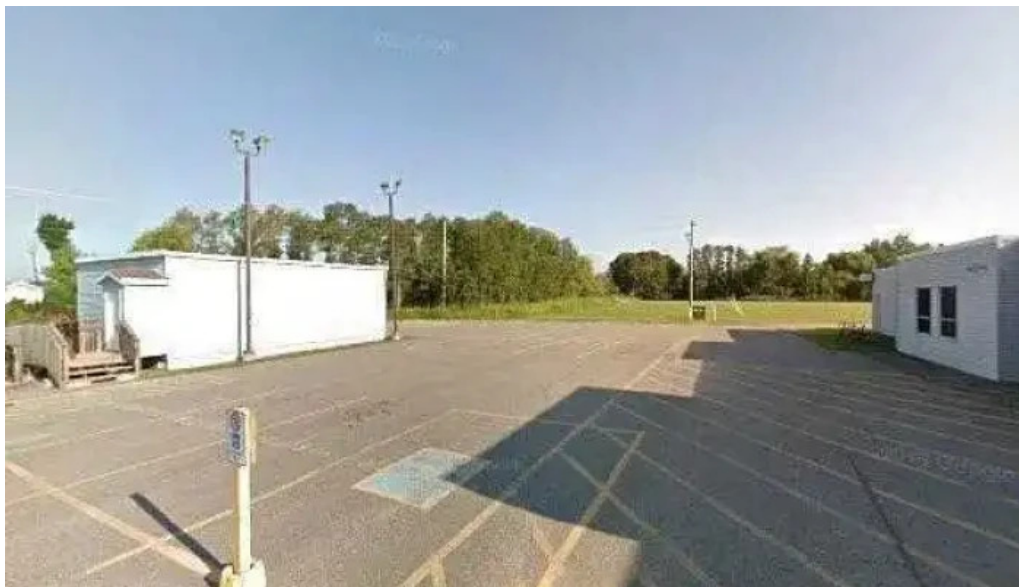
Thrive child development centre street view 360deg