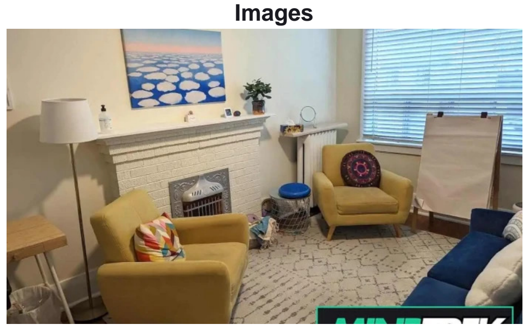
The help hub toronto

If necessary to change any data that you believe is not correct about this web, please deliver a message so that we will fix it as soon as possible. Thanks beforehand thank you very much.