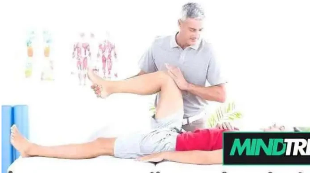
Bodywise health rehab ancaster