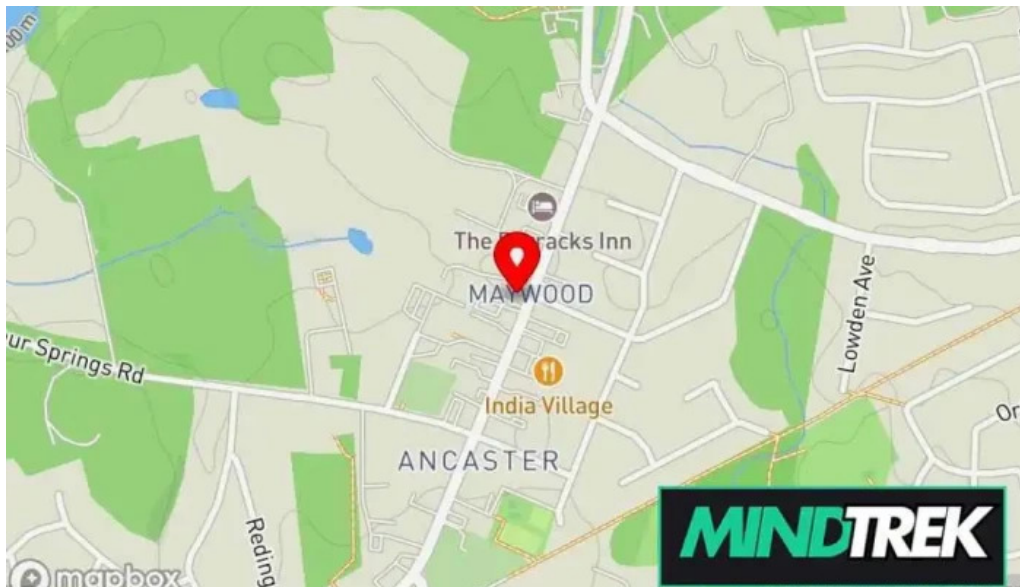
Bodywise health rehab map