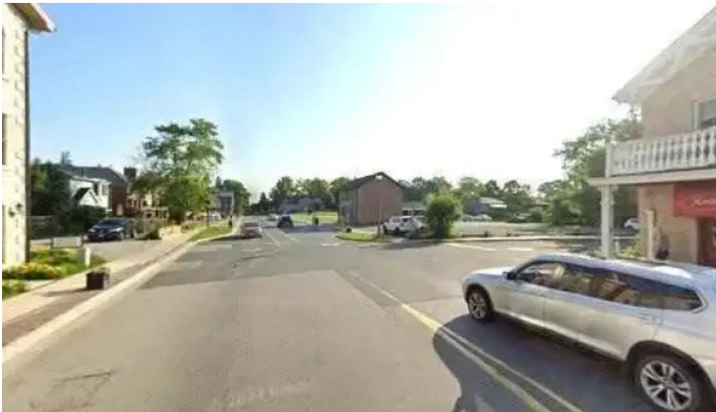
Bodywise health rehab street view 360deg