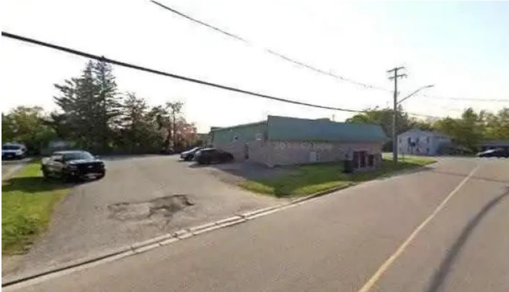
Arnprior chiropractic health centre street view 360deg