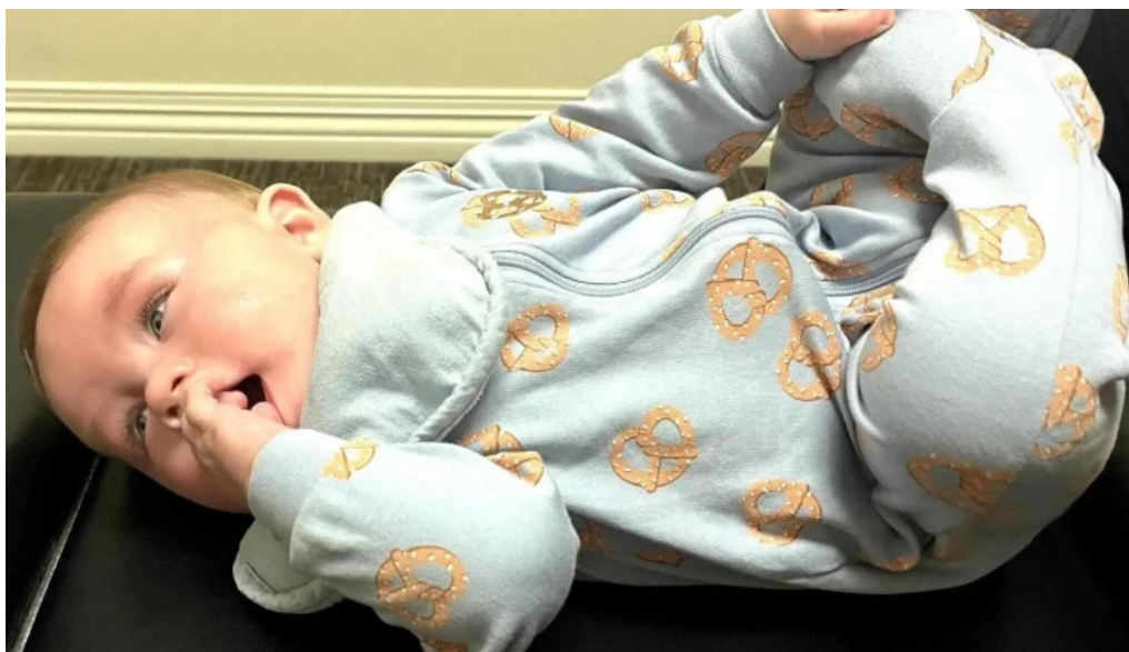
Arnprior chiropractic health centre chiropractor