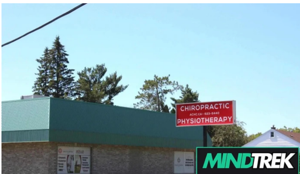
Arnprior chiropractic health centre by owner