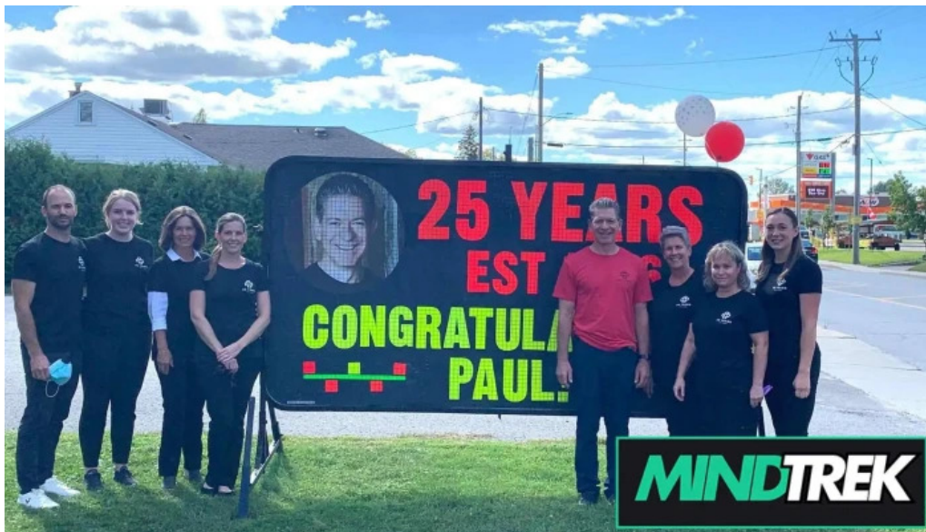
Arnprior chiropractic health centre all