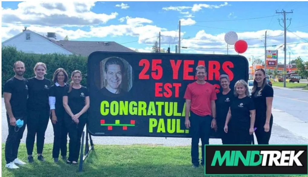
Arnprior chiropractic health centre arnprior