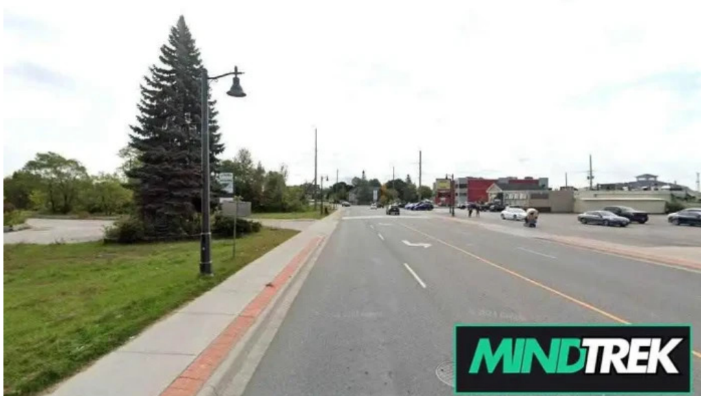
Synergy healthcare group orillia