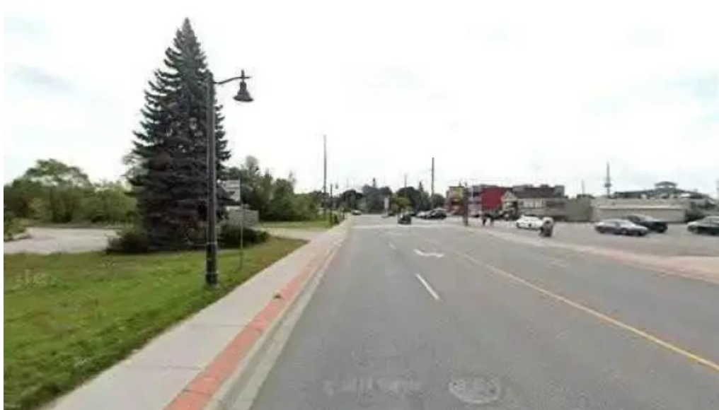
Synergy healthcare group all