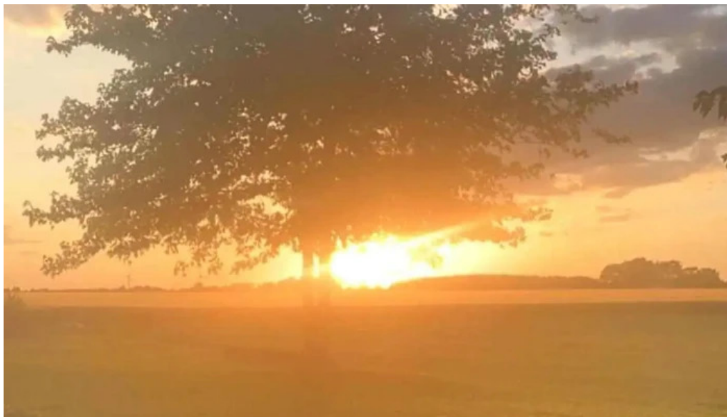
Next step counselling by owner