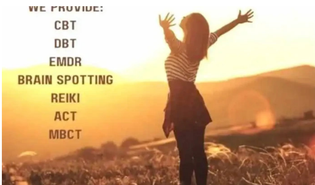
Next step counselling amherstburg