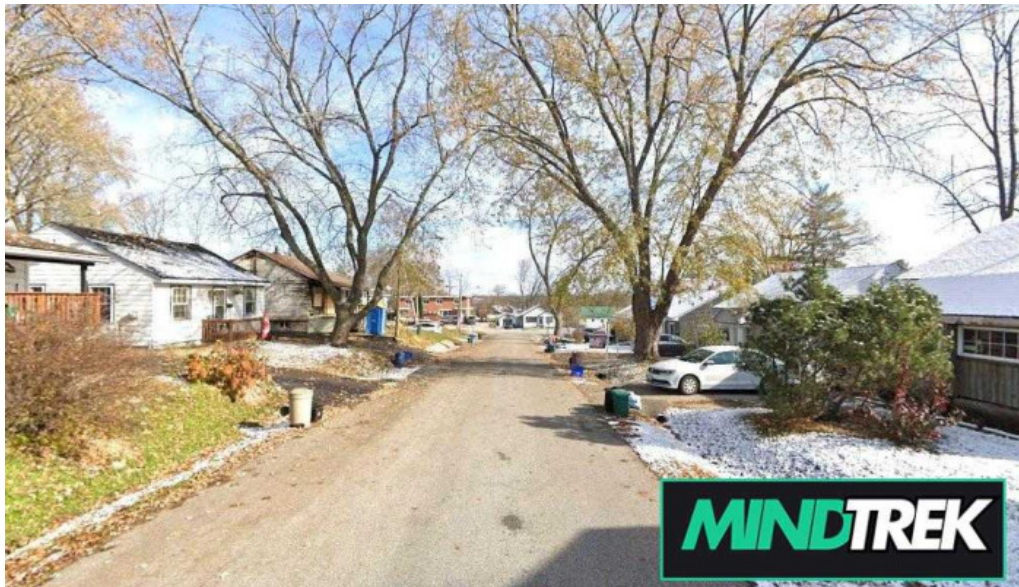
Mindfulness therapy clinic orillia