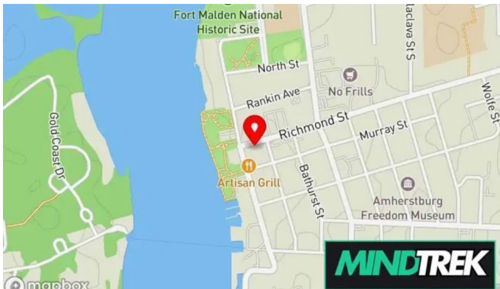
Guiding light counselling services by appointment only map