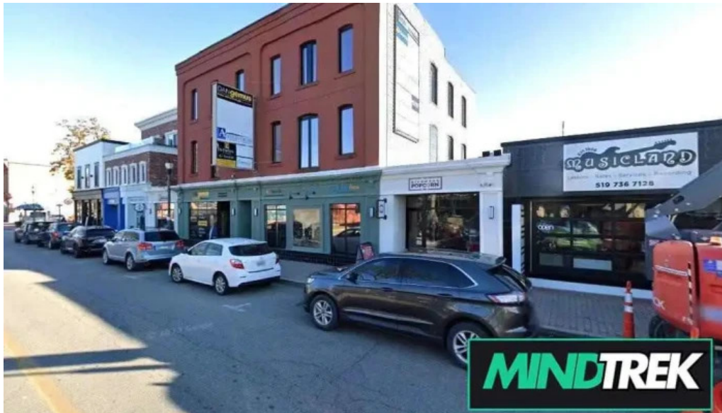
Guiding light counselling services by appointment only amherstburg