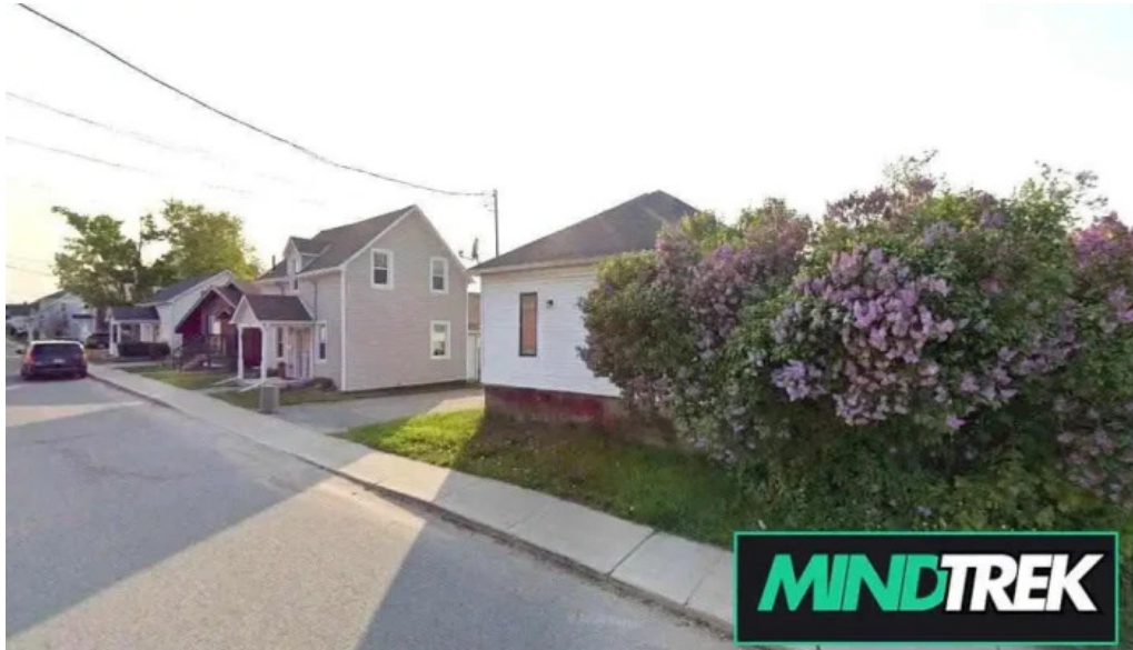
Waves of change counselling psychotherapy ?? arnprior