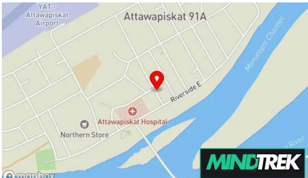
Asnea counselling unit map