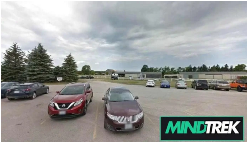
Mainstream therapy barrie