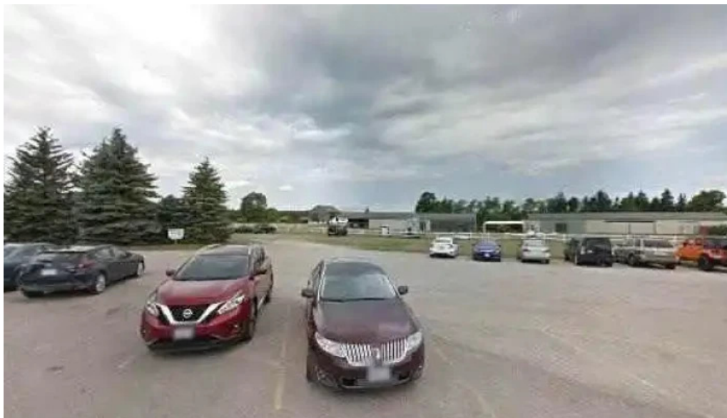
Mainstream therapy all