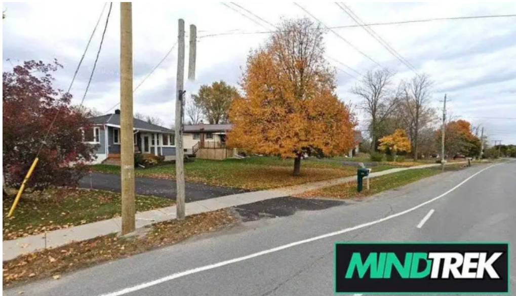
Couples in step counselling bath