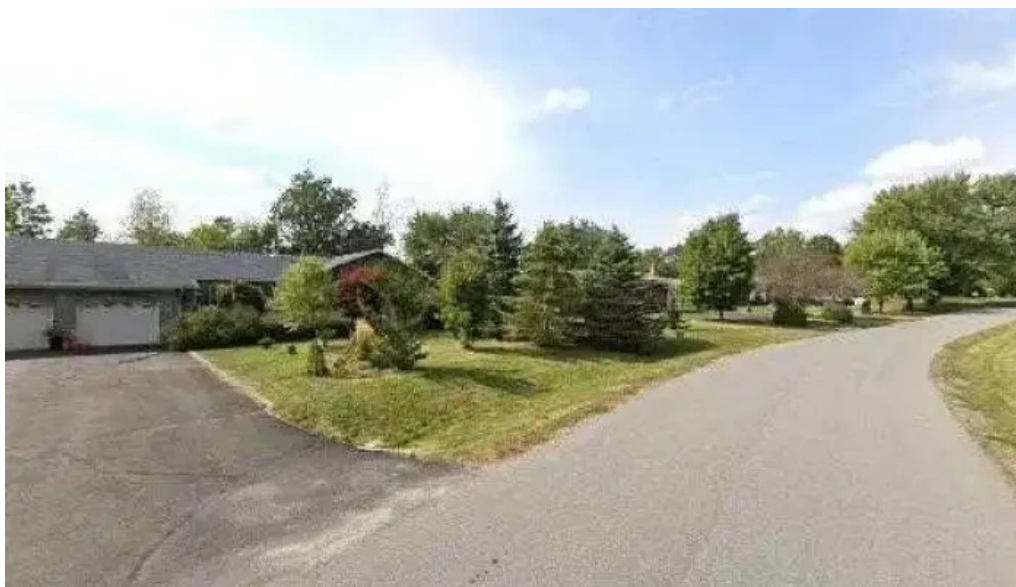
Judith cox counseling all