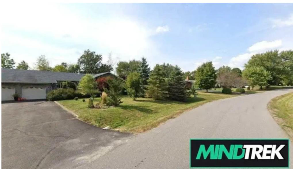
Judith cox counseling bath