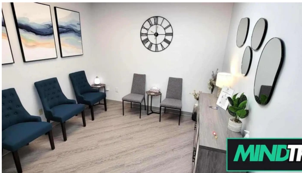
Obsidian counselling therapy inside