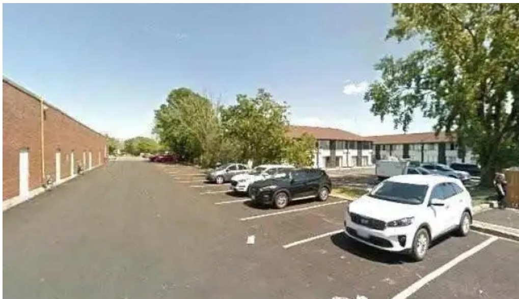
Obsidian counselling therapy street view 360deg