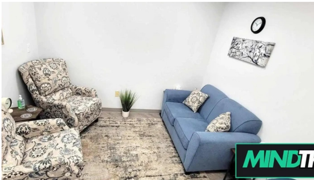
Obsidian counselling therapy belleville