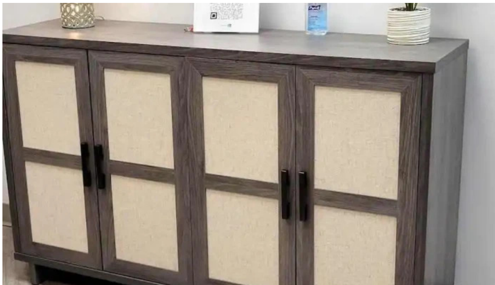
Obsidian counselling therapy by owner