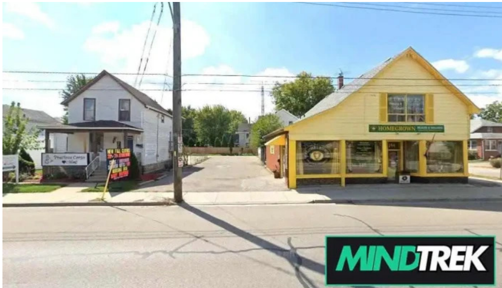
Renewed hope counselling chatham kent ontario chatham