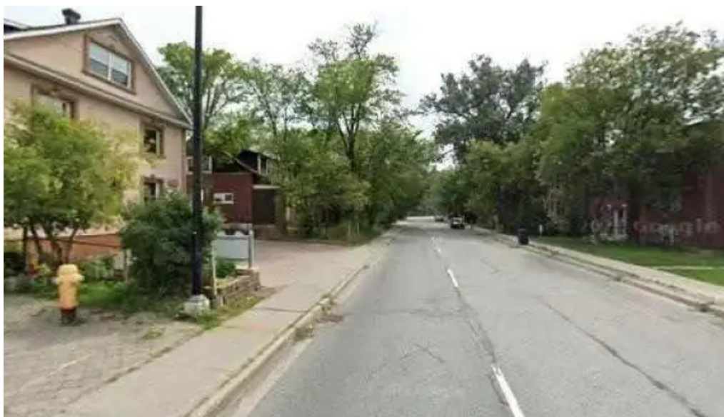
Centre de counselling de sudbury all