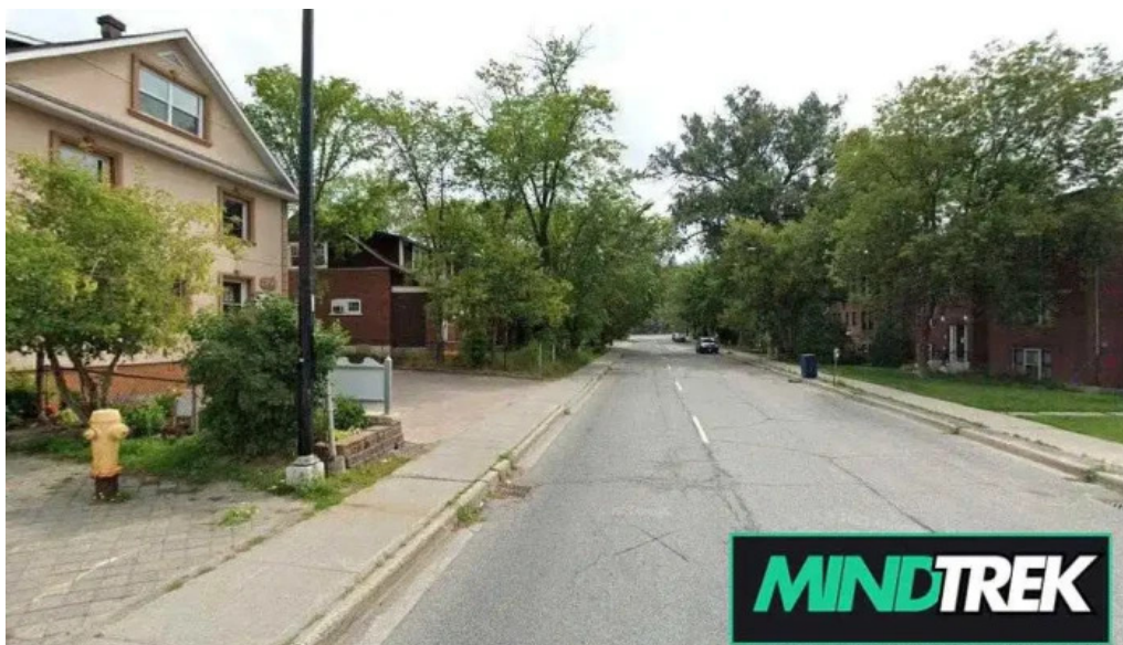
Centre de counselling de sudbury greater sudbury