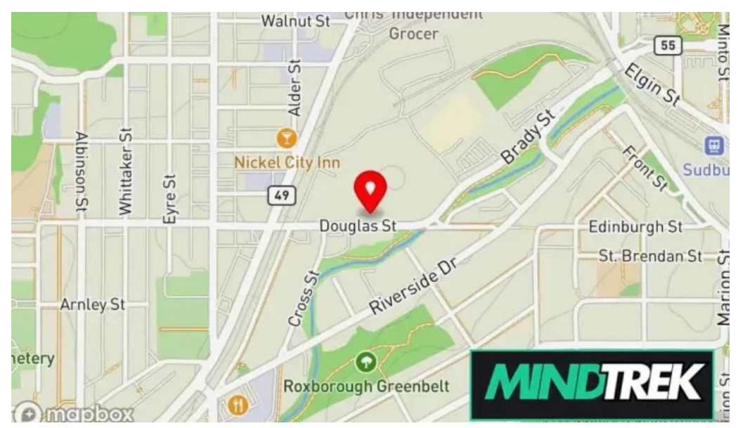
D zannier counselling consulting services map