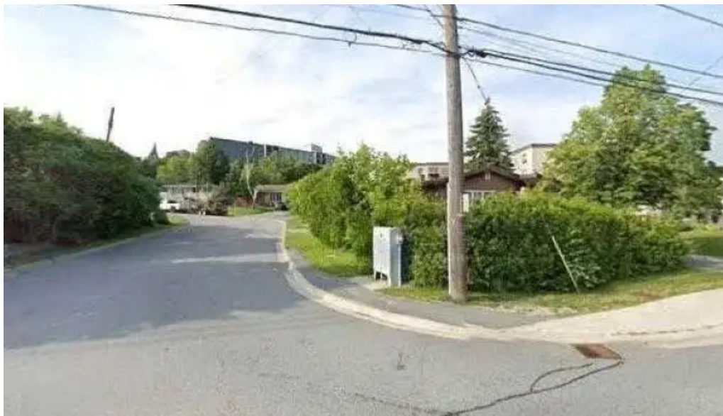
Kusan counselling mediation consultation all