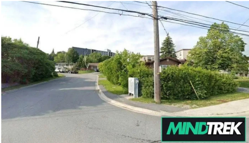
Kusan counselling mediation consultation greater sudbury