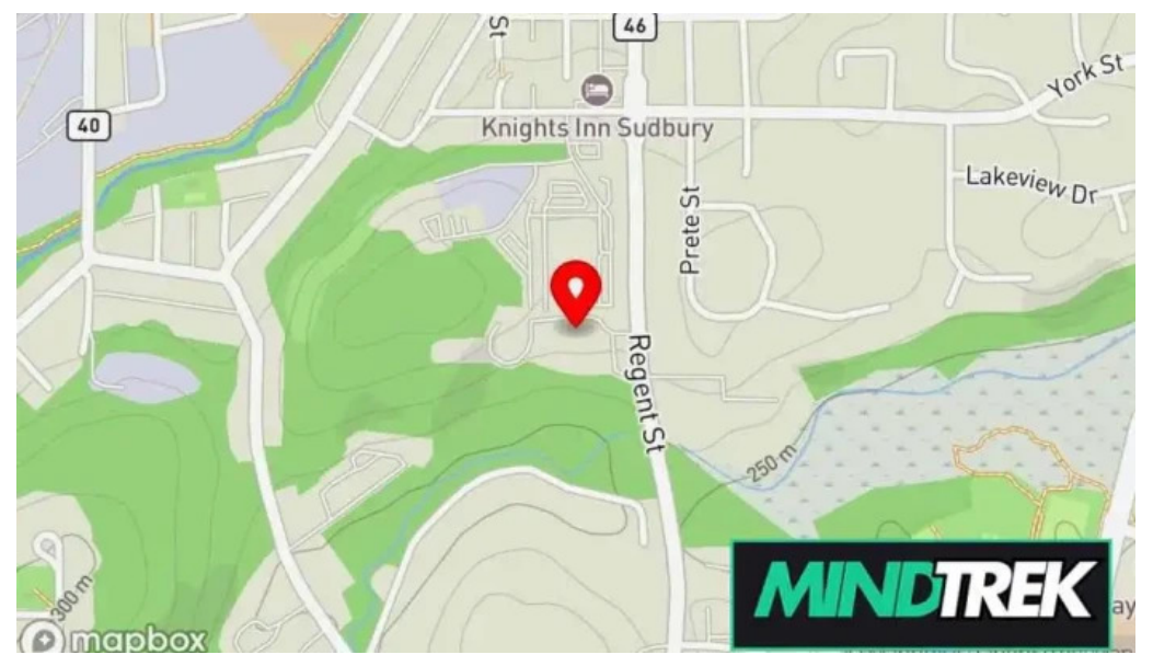
Rise counselling psychotherapy map