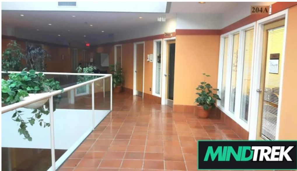
Bayridge counselling centres hamilton all