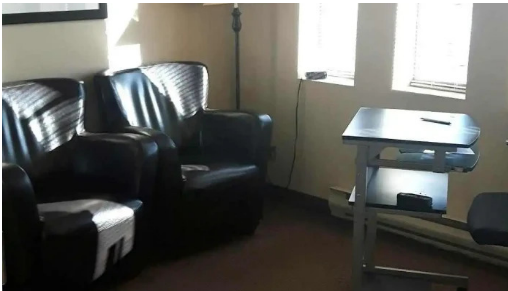
Bayridge counselling centres hamilton inside