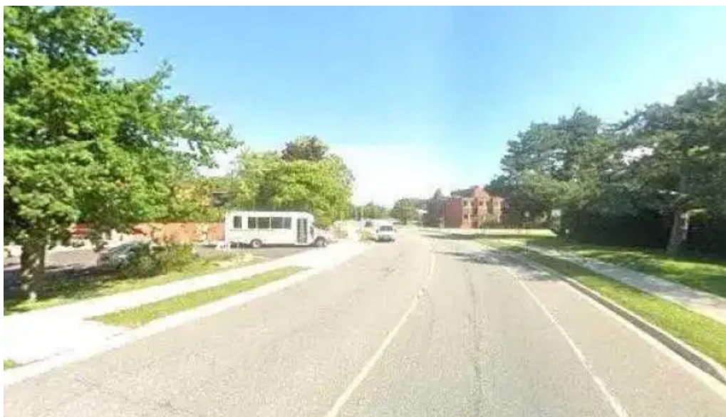
Bayridge counselling centres hamilton street view 360deg