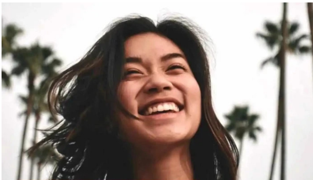
Bayridge counselling centres hamilton videos