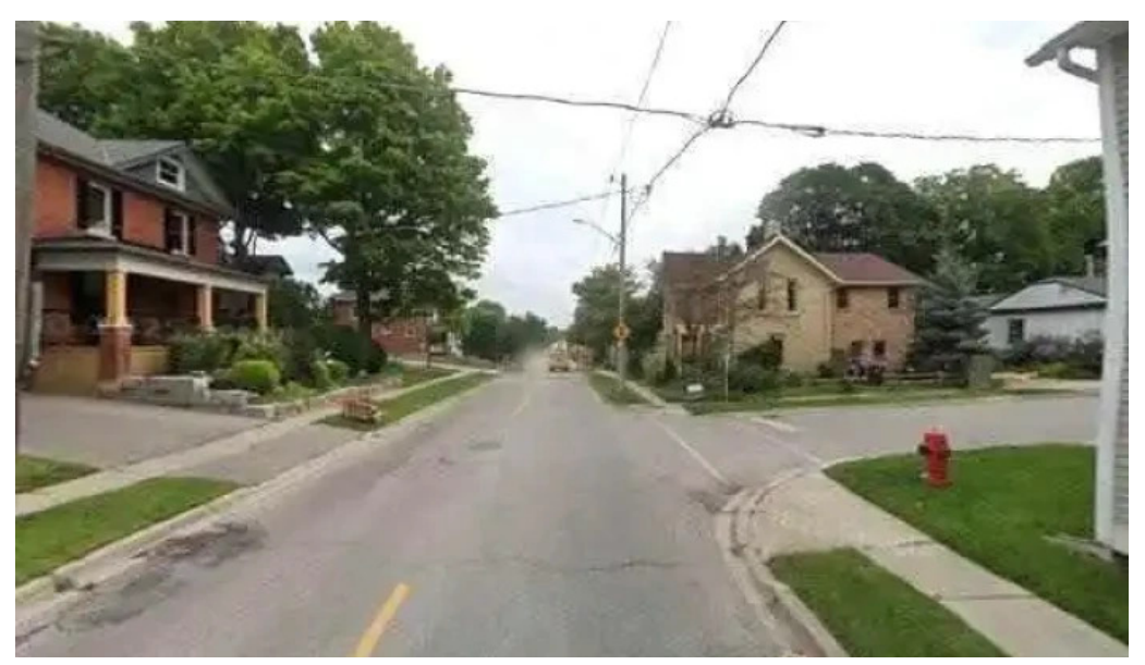
Leticia osei psychotherapy all