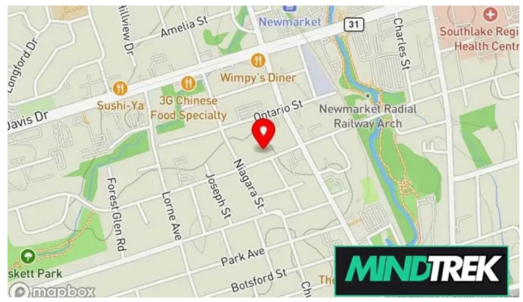
Leticia osei psychotherapy map