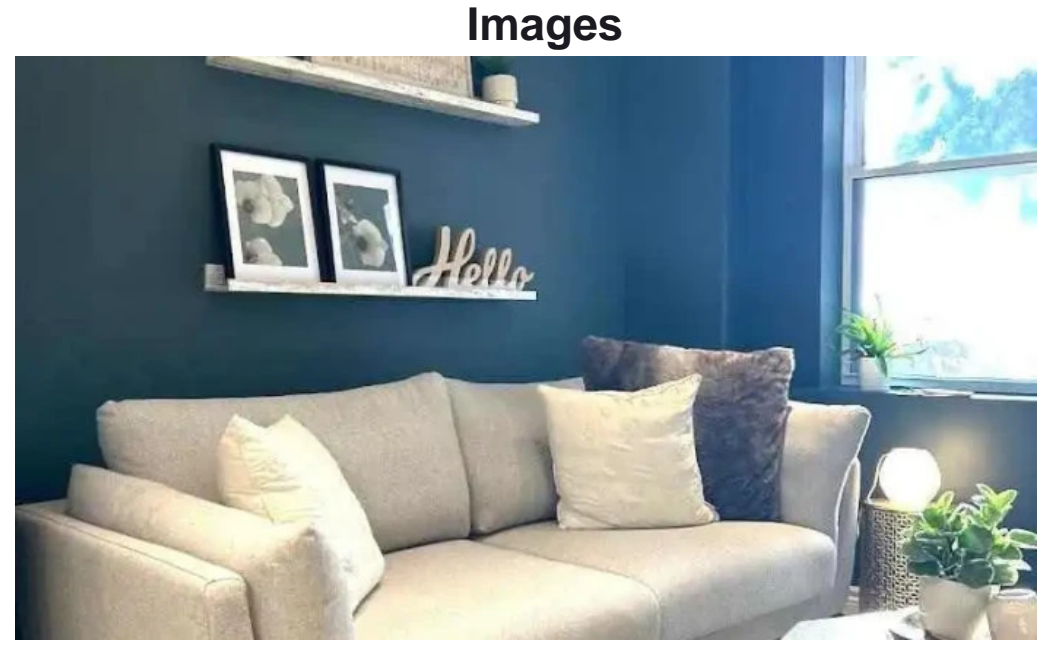
Hello counselling services port hope

If you wish to update any detail that you think is incorrect regarding this page, we ask forward a message so we can we will adjust it at the earliest convenience. In advance thank you very much.