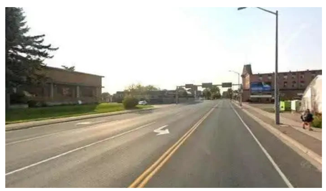
Insights outsights eva deboer all