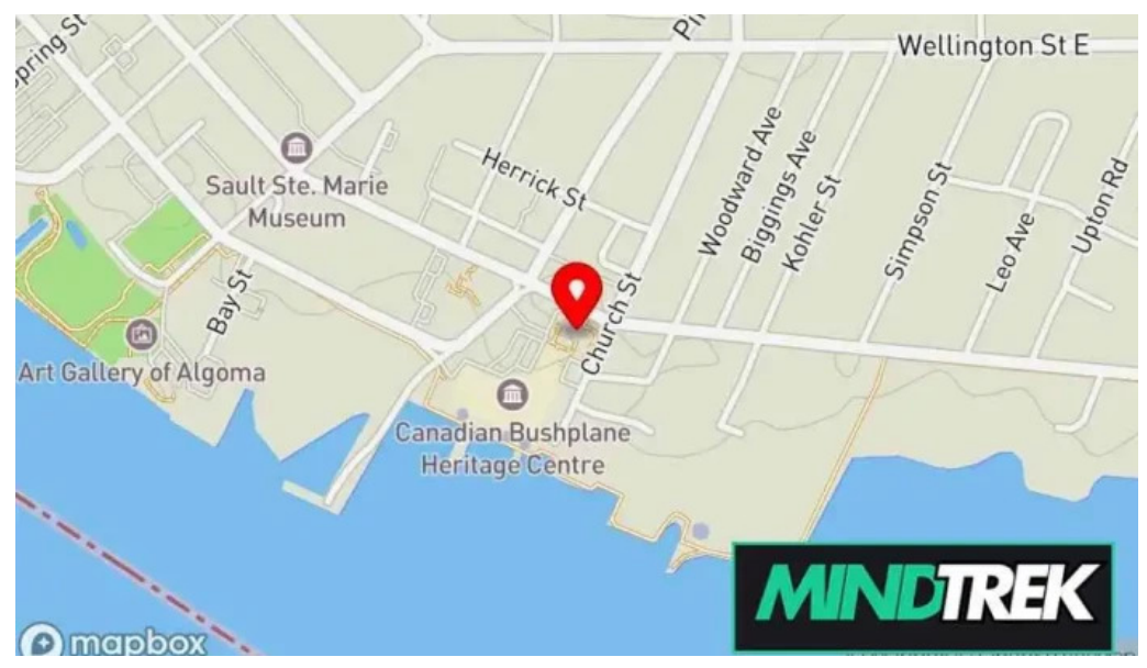
Insights outsights eva deboer map