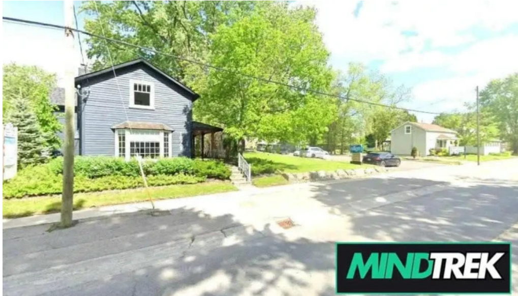
Trauma centre sharon