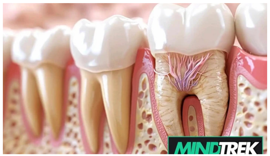
Chatham family dental chatham