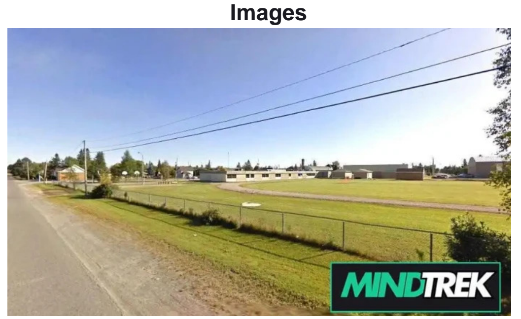
Englehart family dental centre englehart

If you need to change any detail that you think is not accurate concerning this page, we urge you to send a message so we can we will fix it promptly. With anticipation we appreciate it.