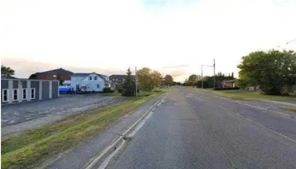
Northwood medical clinics street view 360deg