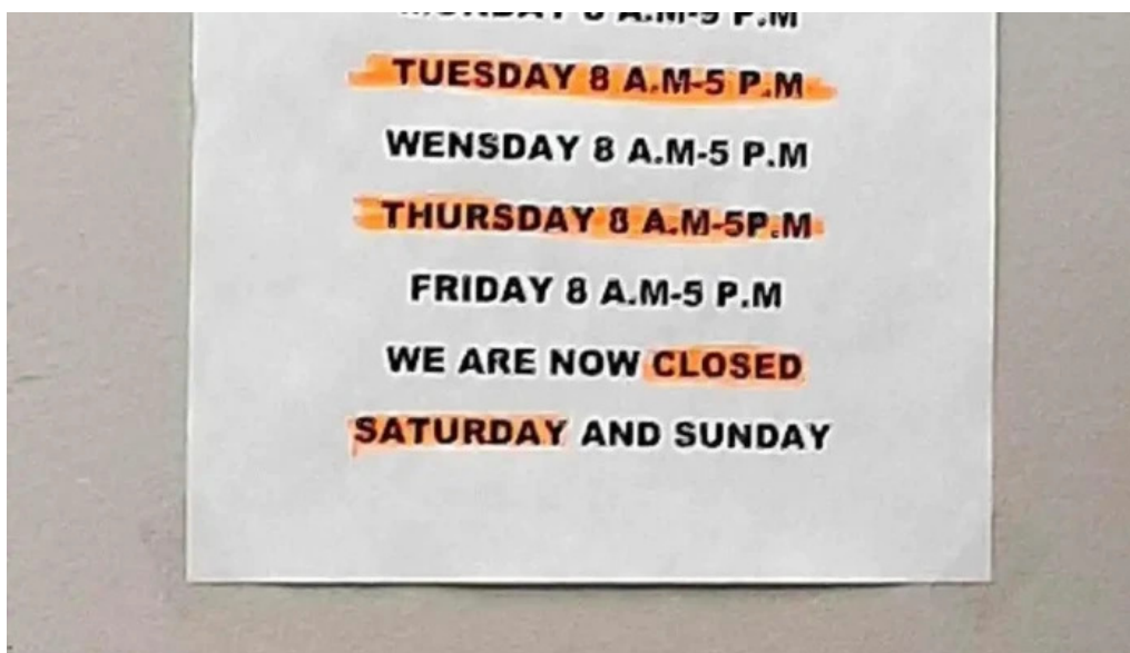
Northwood medical clinics all