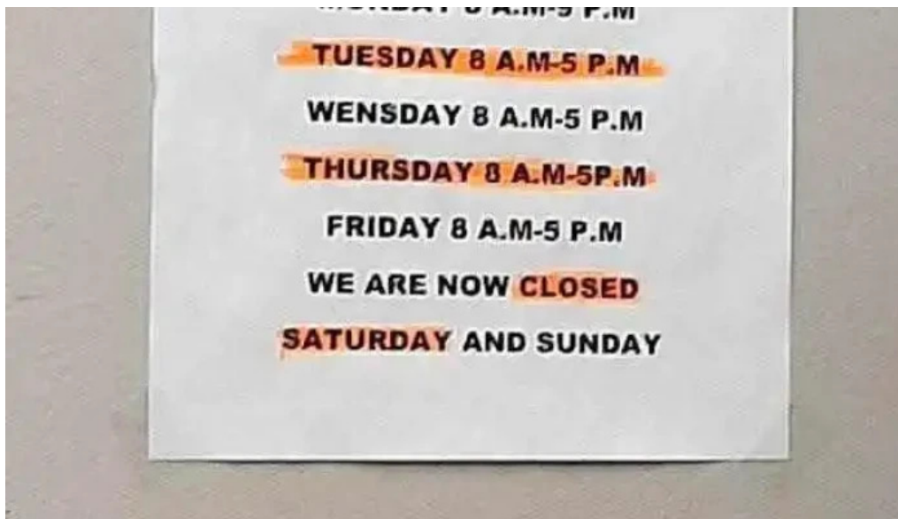
Northwood medical clinics azilda