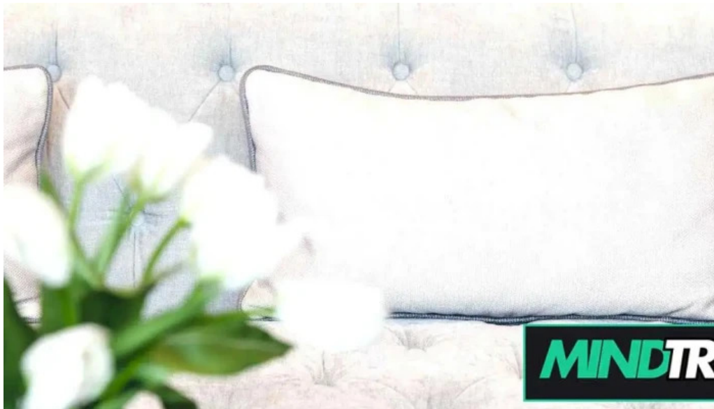
Collette macdonald the growth group barrie