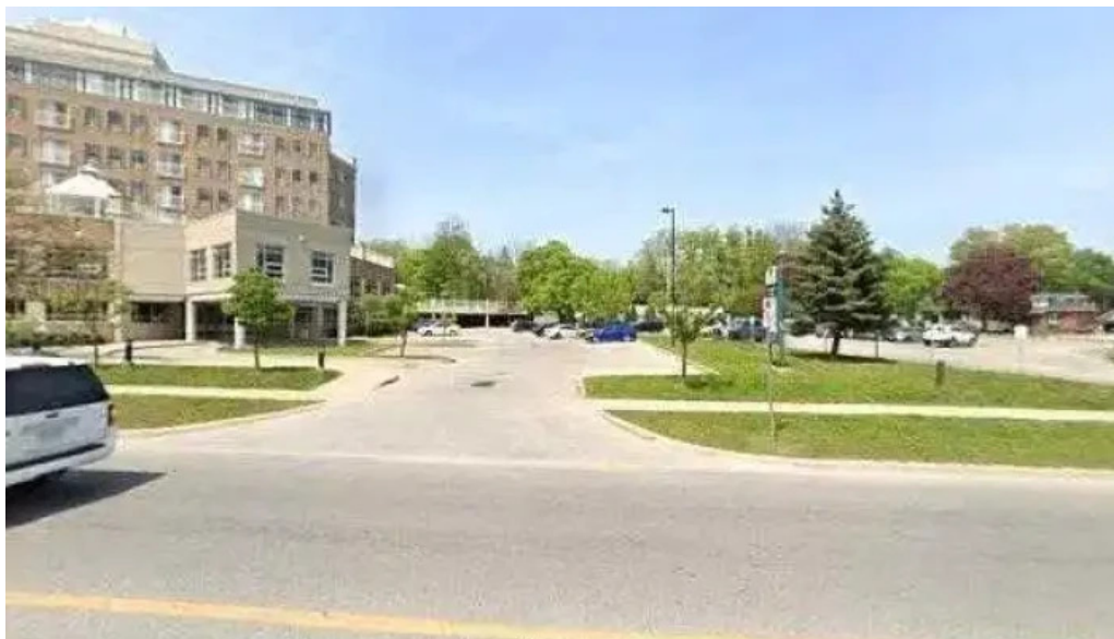
Collette macdonald the growth group street view 360deg