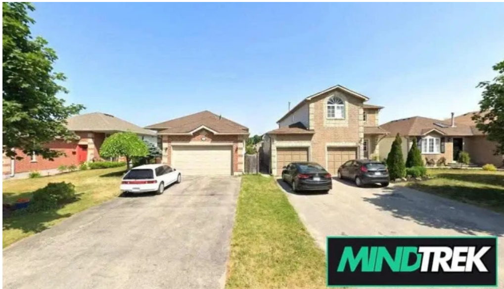
Dalton associates barrie