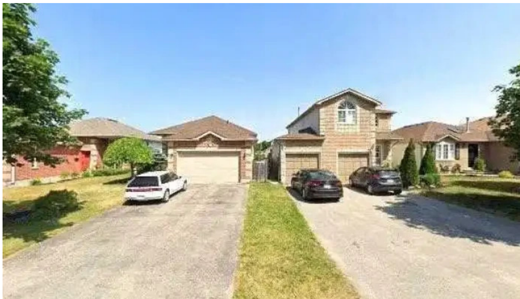
Dalton associates all