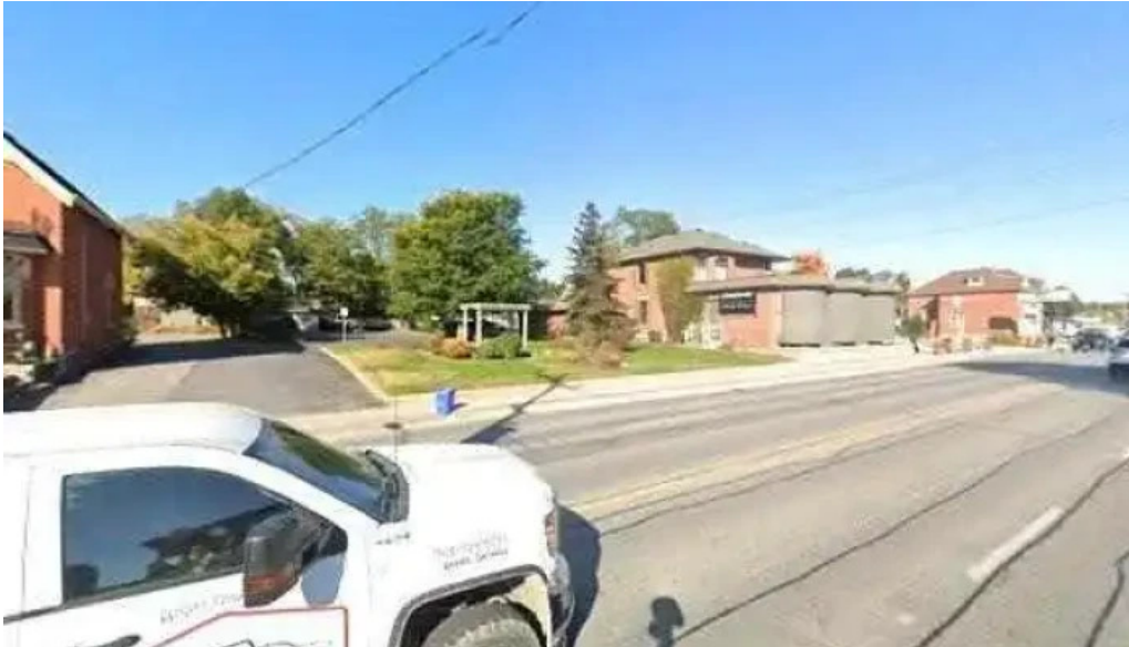
Family tlc street view 360deg