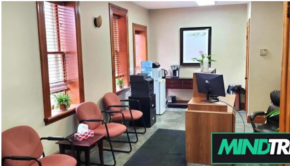
Family tlc inside