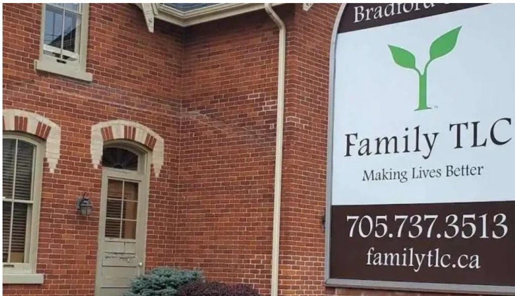
Family tlc by owner