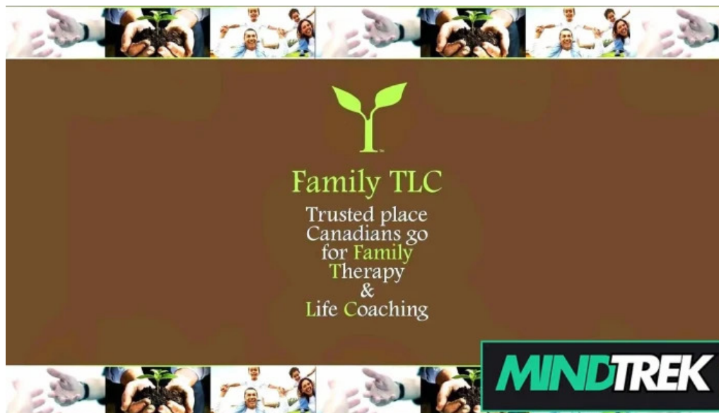
Family tlc barrie