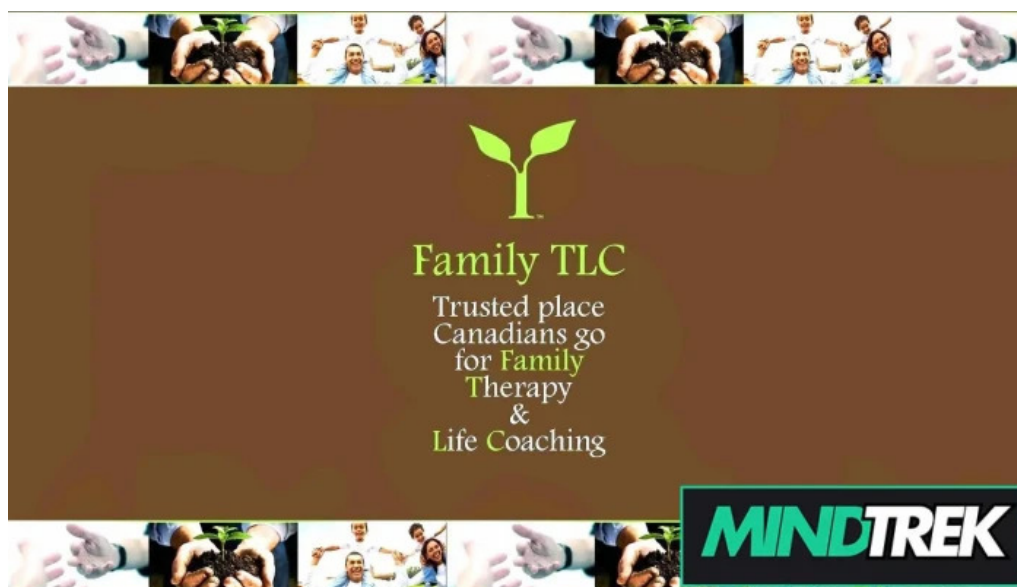
Family tlc all