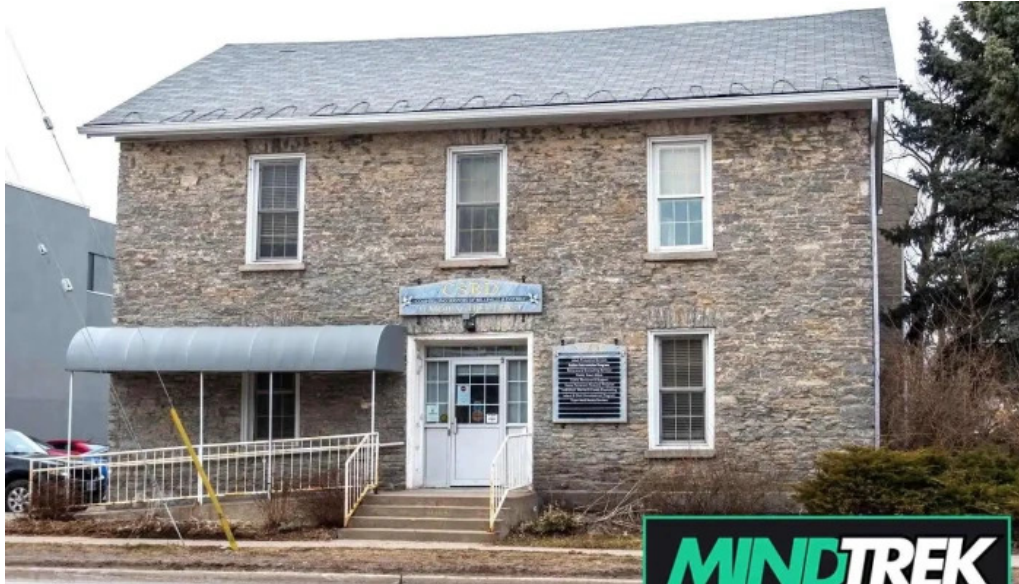
Counselling services of belleville district belleville