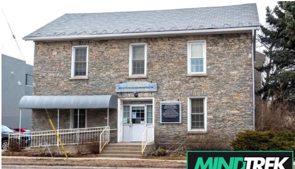
Counselling services of belleville district all