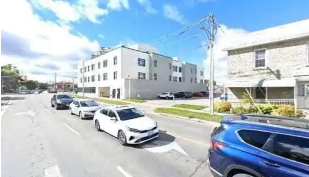
Counselling services of belleville district street view 360deg