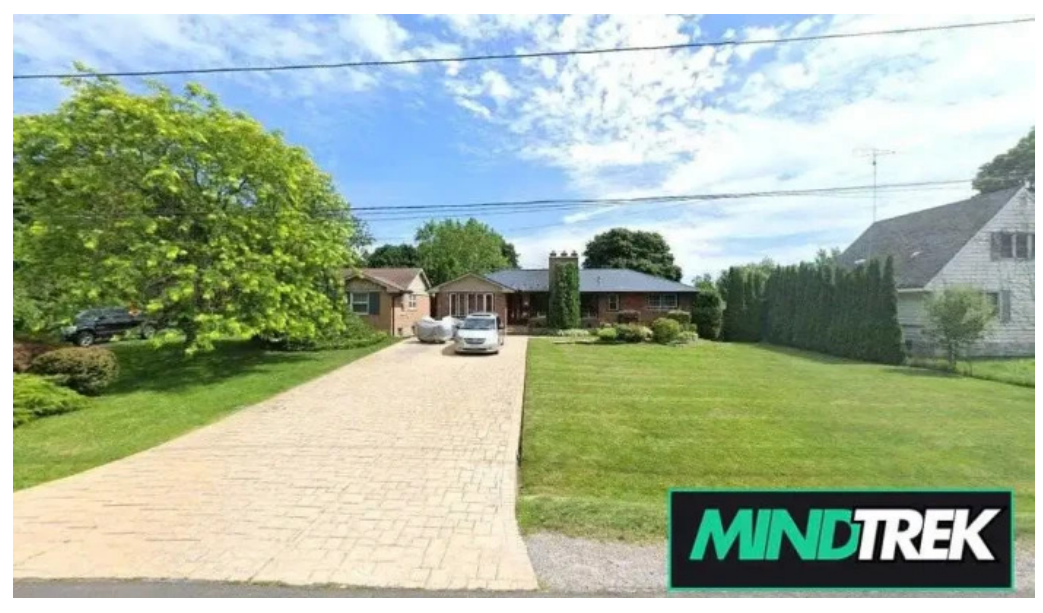
Connection counselling services cobourg