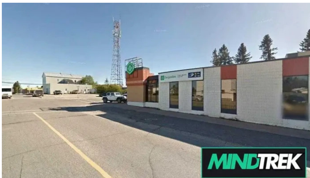
A wellness connection counselling service cochrane