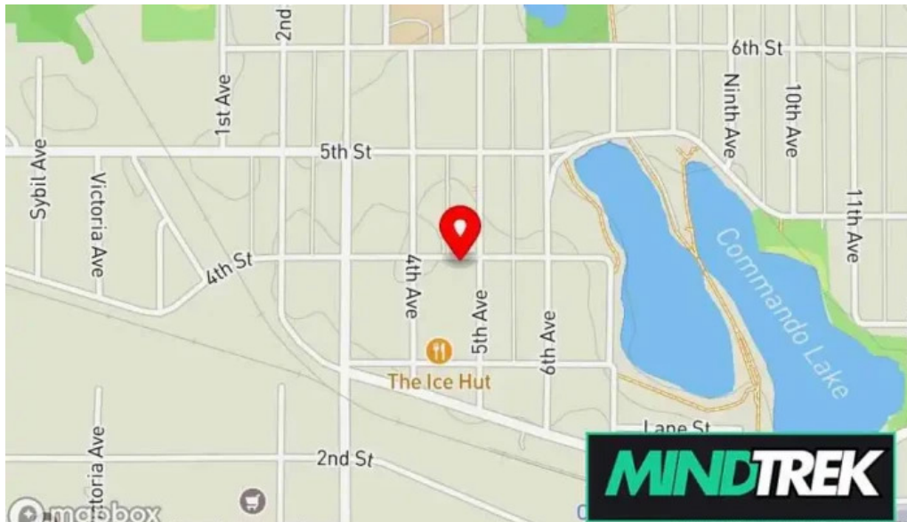
A wellness connection counselling service map