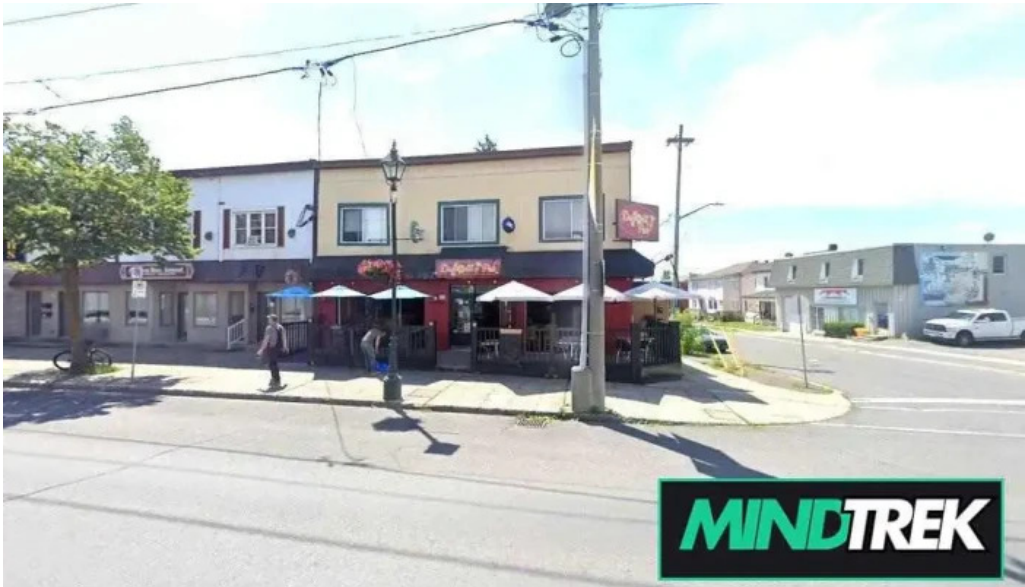
Counselling and support services of stormont dundas and glengarry cornwall