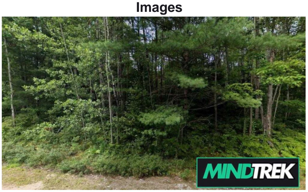
Walk in counselling clinic deep river

If necessary to update any detail that you believe is not precise related to this page, please send us a message so we can we will correct it quickly. With anticipation thank you very much.