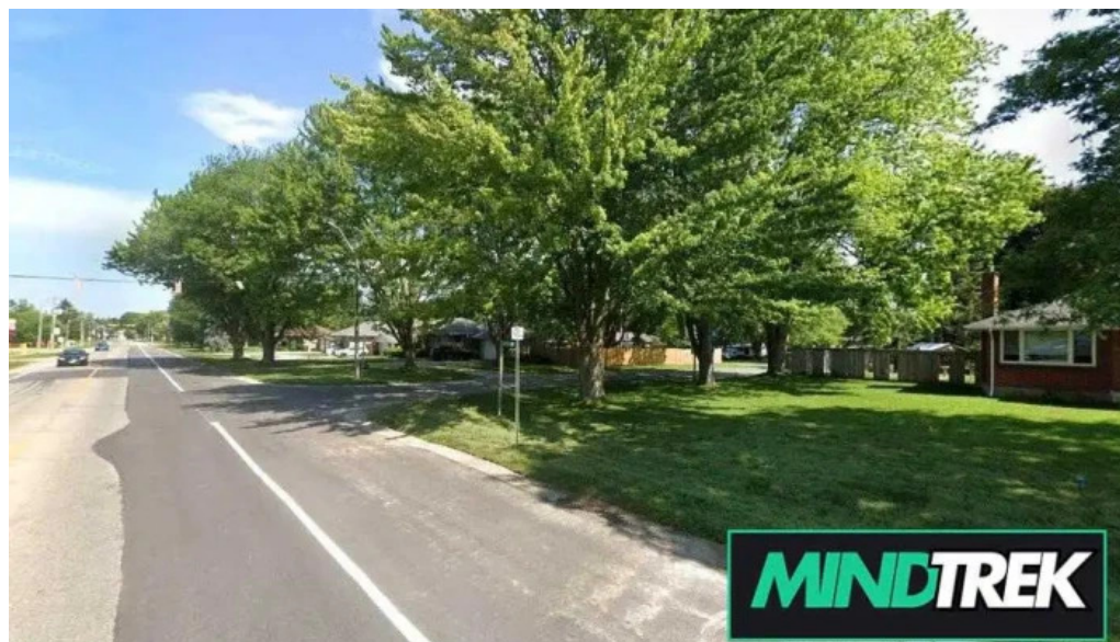
Dawne wahby counselling dorchester