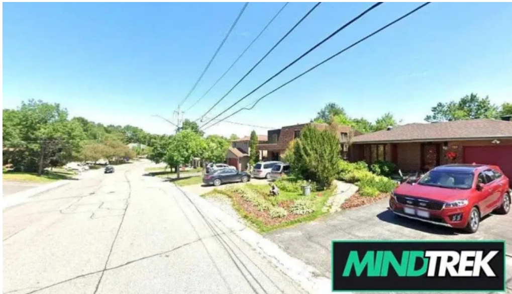
White pine counselling centre greater sudbury