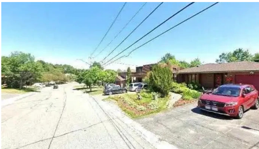
White pine counselling centre all