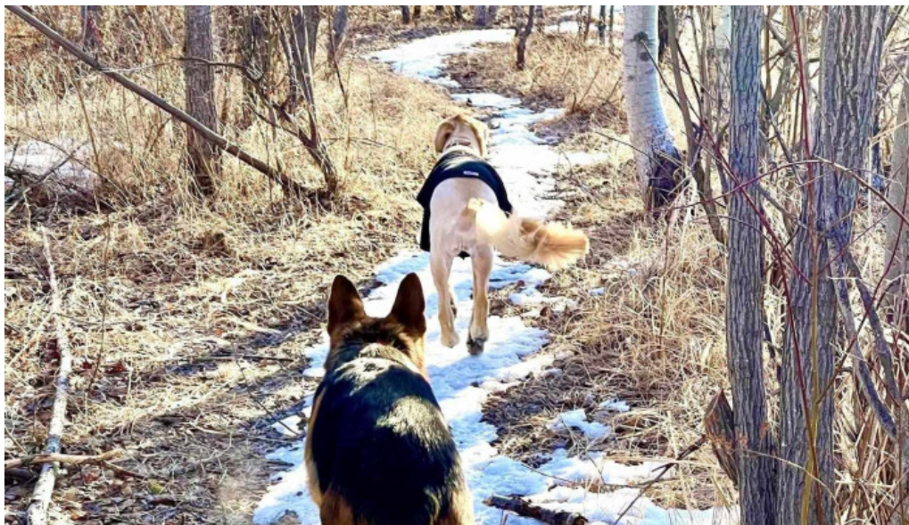
White pine counselling centre by owner