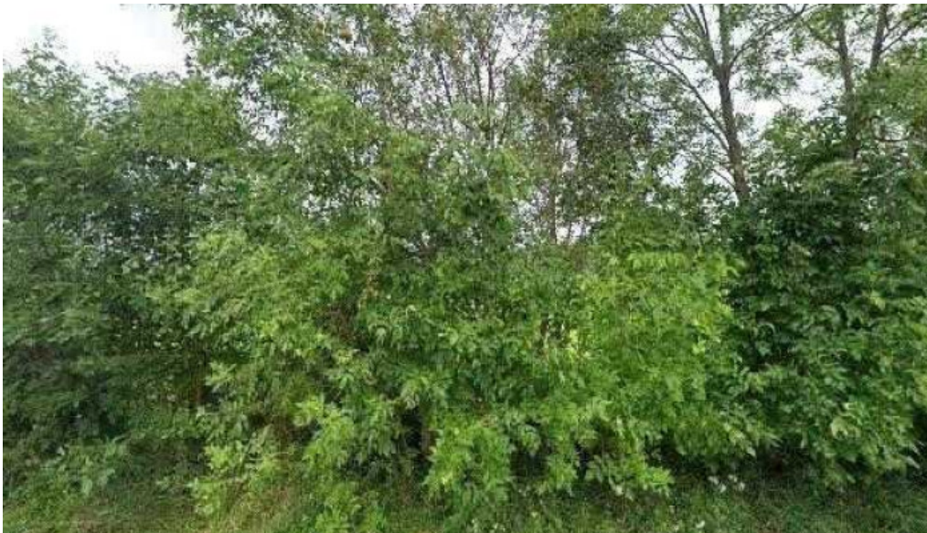
Fecht sandra m a counselling service all