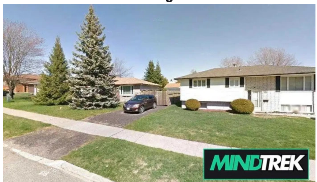
Walden assessment counselling services sudbury