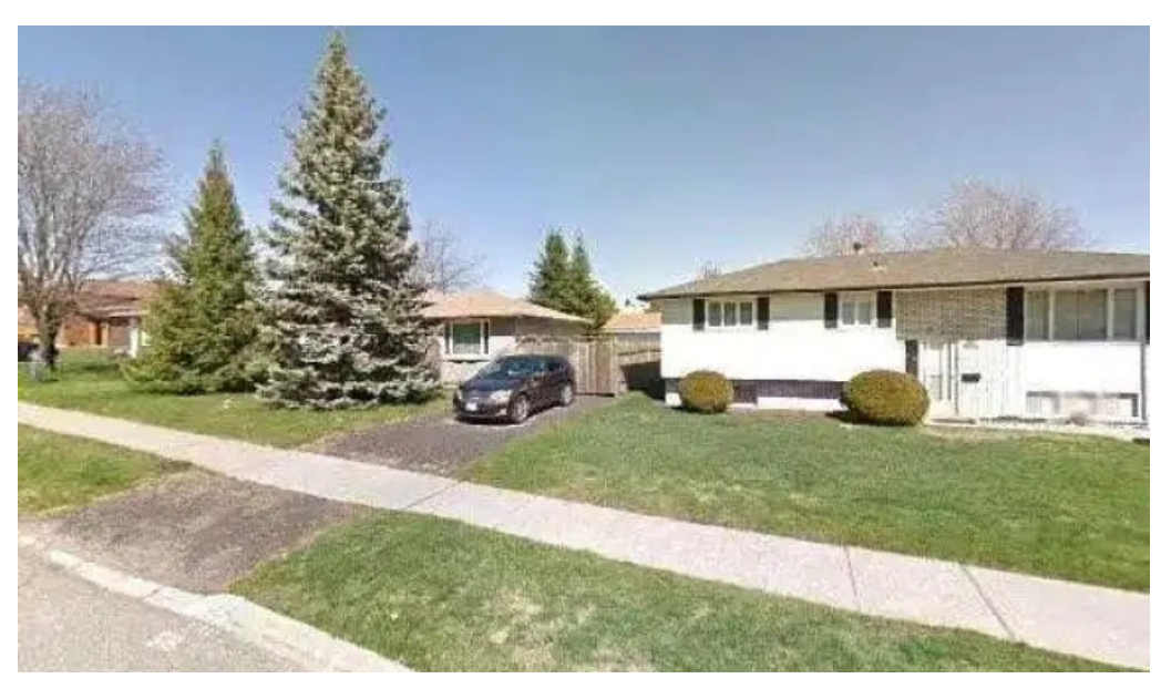
Walden assessment counselling services all