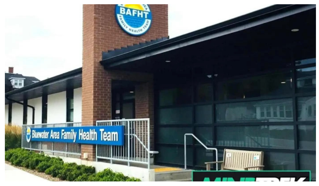
Bluewater area family health team zurich