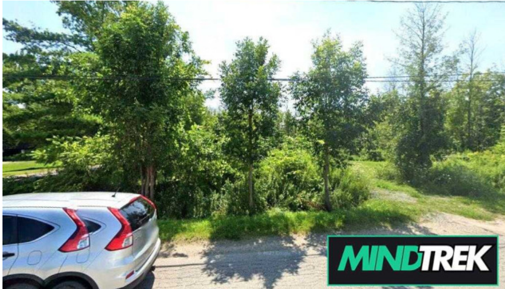
Catholic family services of simcoe county collingwood