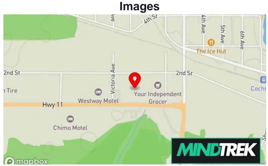
Cochrane hgh therapy clinic map

If you require to update any detail that you believe is not correct about this site, please send us a message and we will handle it at the earliest convenience. Thank you in advance we appreciate it.