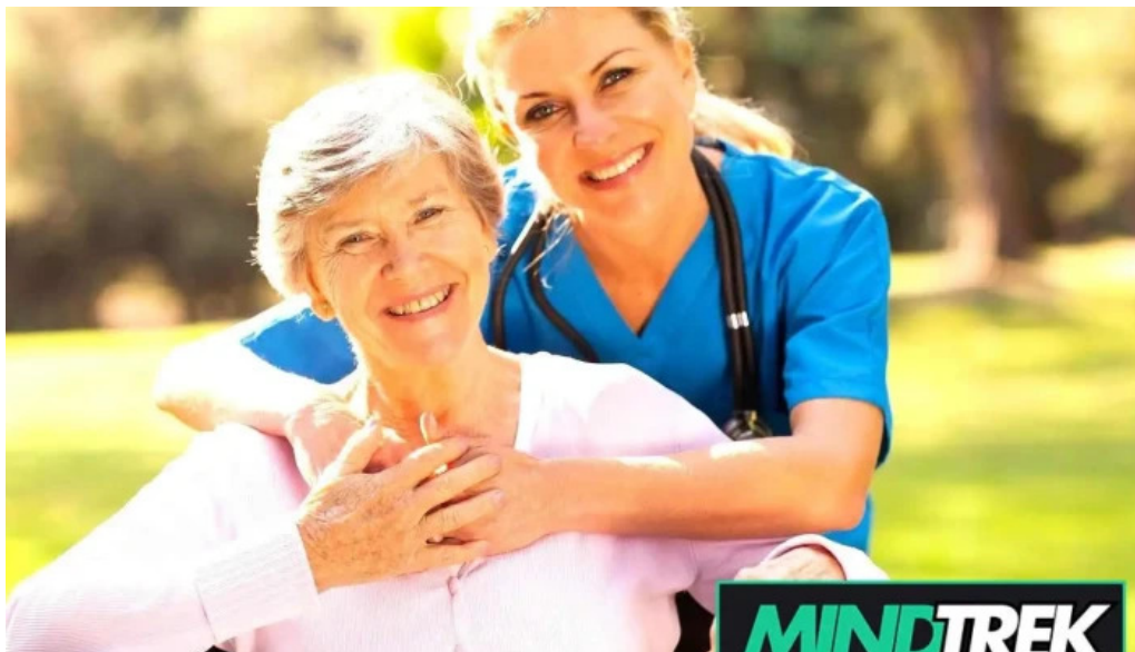
Ask4care support services inc barrie