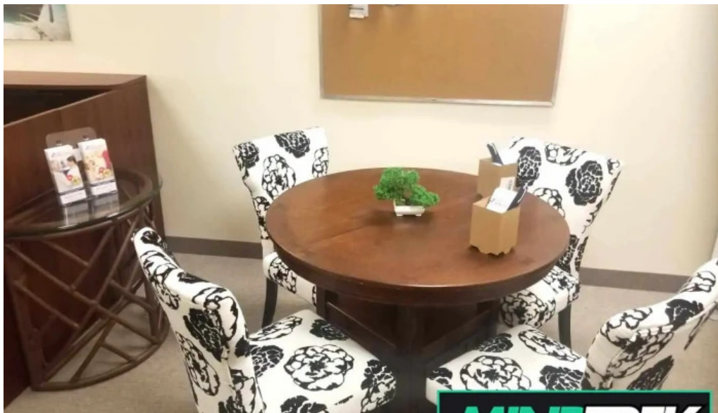
Ask4care support services inc inside