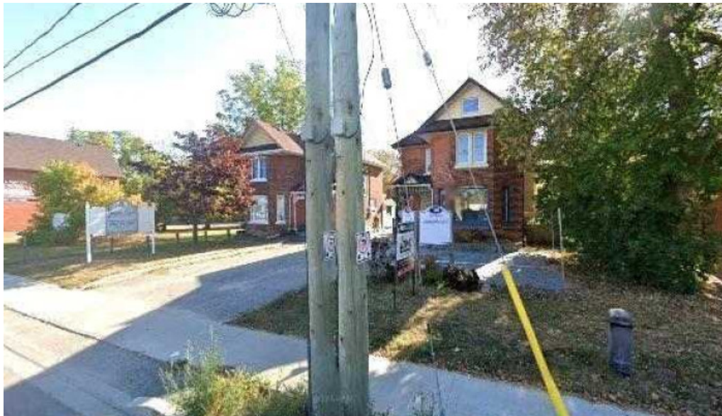
Ask4care support services inc street view 360deg