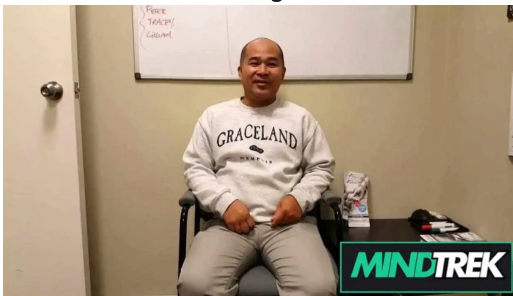
Ask4care support services inc videos