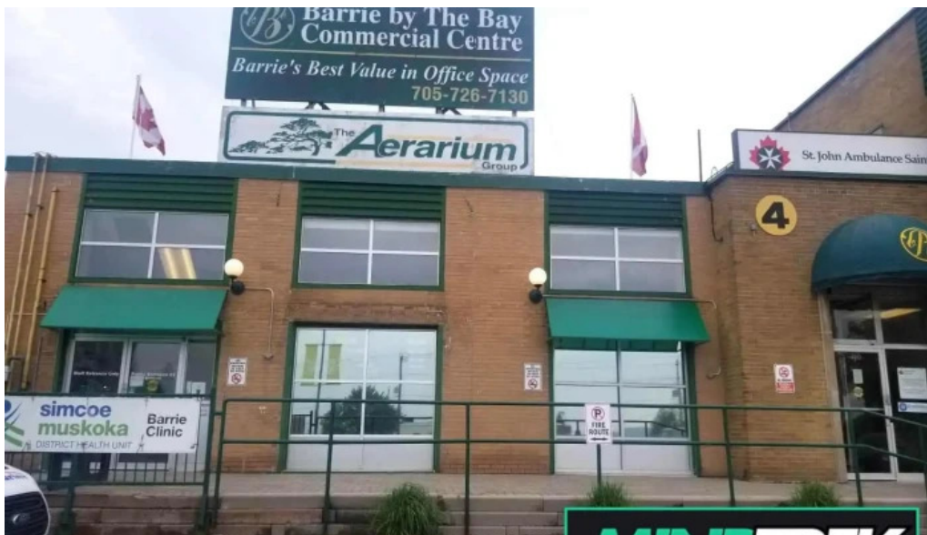
Ask4care support services inc exterior