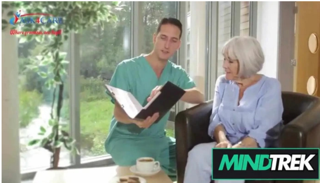
Ask4care support services inc by owner