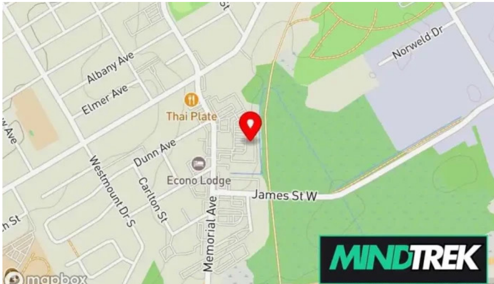
Royal proresp inc orillia map